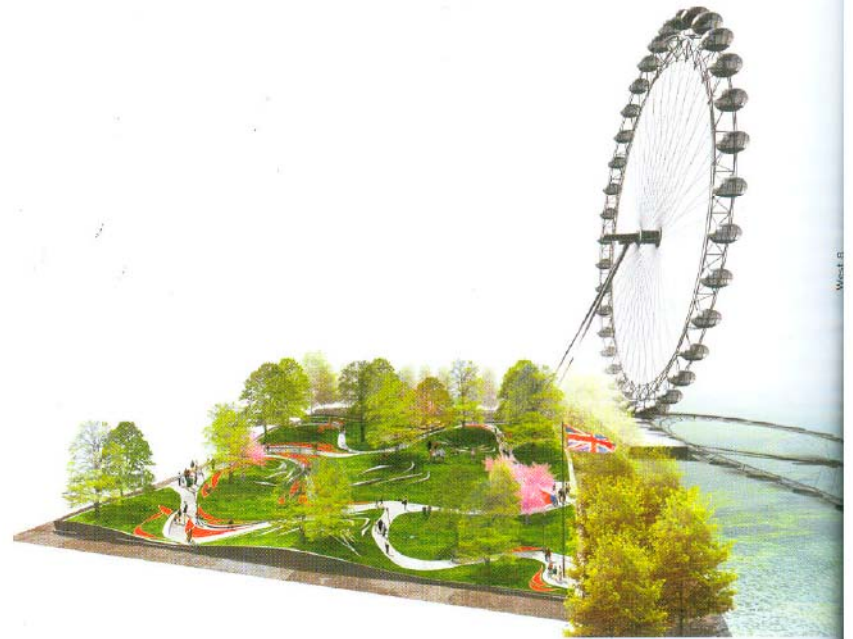
The landscape architects of West 8 convinced the jury for the Jubilee Gardens competition with their idea for a year-round green park with a man-made hilly landscape which provides views of the River Thames.

trees in the park and due to additional problems with the forest ecology (a combination of rocky terrain and the repeated removal of cut timber over the past 250 years have left what little soil there is deficient in nutrients), Southwest Properties Limited and Halifax Regional Municipality Competition issued the international competition. The destruction caused by the hurricane is seen as an opportunity to plan a sustainable ecosystem for the future and to redevelop the park in order to better meet the needs of park users. www.pointpleasantpark.ca